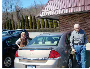
Hoss's Photos Continued