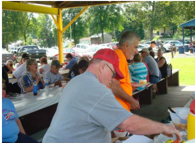
Kish Park continued