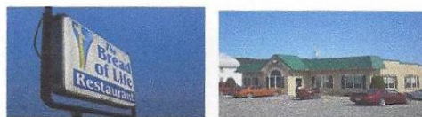
Bread of Life Restaurant Route 35, McAlisterville

The third club event is scheduled for Saturday, April 7 at the Bread of Life Restaurant in McAlisterville. This will be the second year for this location, just off Route 35 beside the newer Juniata Valley Bank and across from the Dollar Store and Sal's OIP. Let's try to make this a good one, as the club will earn 20% of all food purchases at breakfast, lunch, or dinner. Times for this event are from 6:00 a.m. until 9:00 p.m. It is a very nice establishment and the food is excellent.