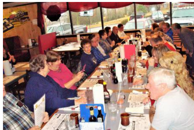
Red Zone Breakfast continued