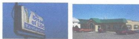
Bread of Life Restaurant Route 35, McAlisterville